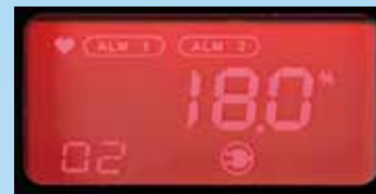
Danger screen (red)